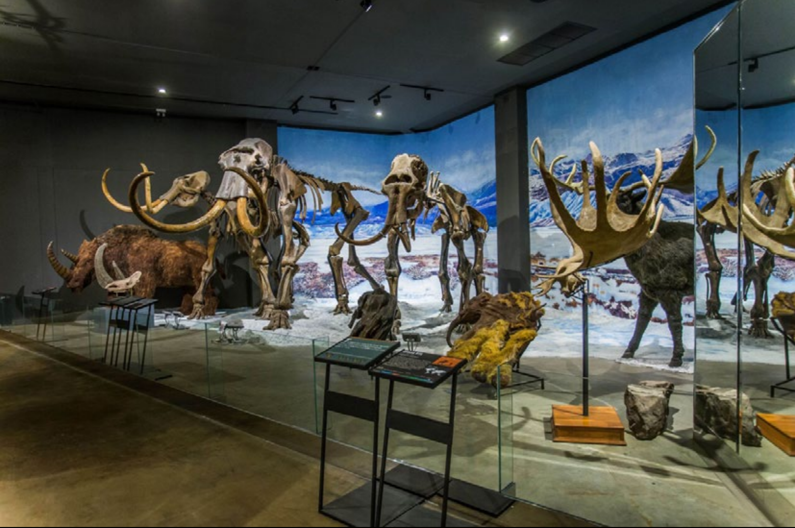
Exhibition design example